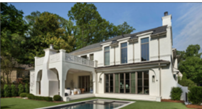
DECK / PATIO / PORCH