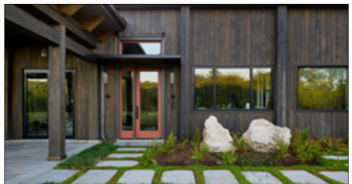
VACATION HOME EXTERIOR